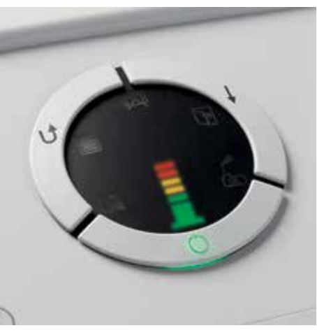
Paper quantity sensors prevent the document shredder from starting if too much has been fed in to avoid paper jams