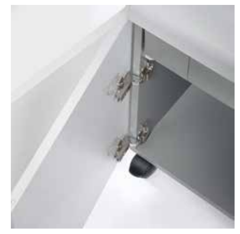
Wide opening door to easily empty the waste bag

Pull-out rounded top frame that's kind on the fingers when changing the waste bag