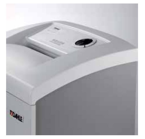
Modern design blends into any working environment.