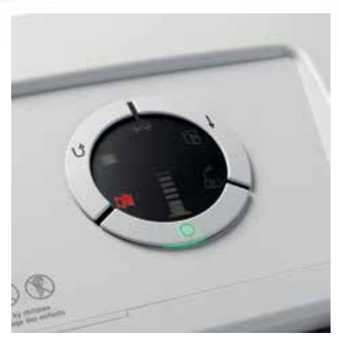
Clearly structured, user-friendly control panel indicates when the fine dust filter needs changing