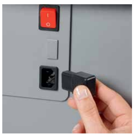
Detachable IEC power plug makes the document shredder quick and easy to move from A to B