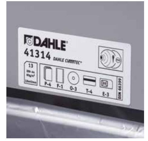
Clearly labelled performance characteristics on the top of the shredder help to ensure correct document shredder operation