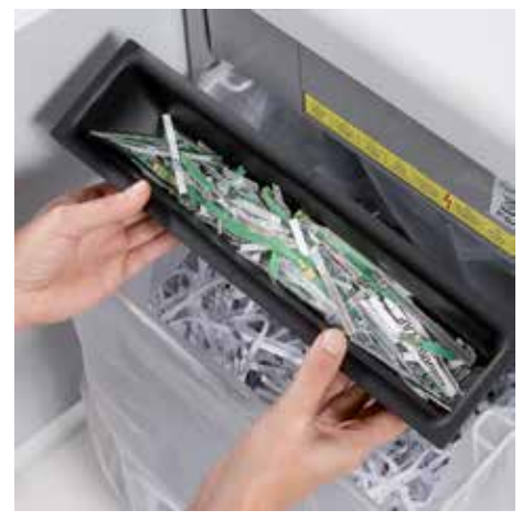
Separate, integrated waste boxes help to sort shredded paper, CDs, DVDs, cheque and credit cards for eco-friendly recycling