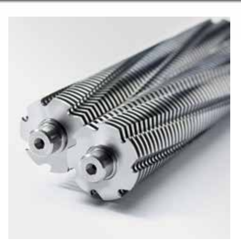
High-quality, solid-steel cutters in special steel for a guaranteed long service life