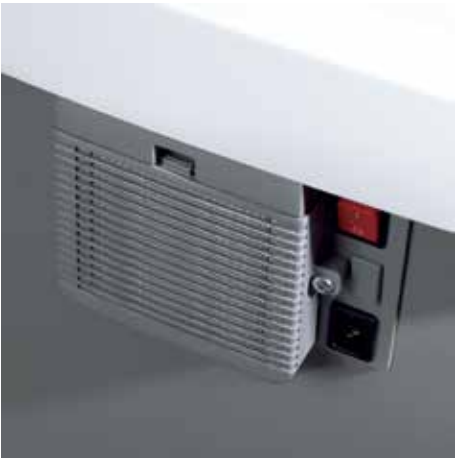
Unique DAHLE CleanTEC® filter system filters and effectively binds fine dust particles to create a better indoor environment.

Environmentally friendly filter is made of special 3-ply, fully recyclable non-woven material