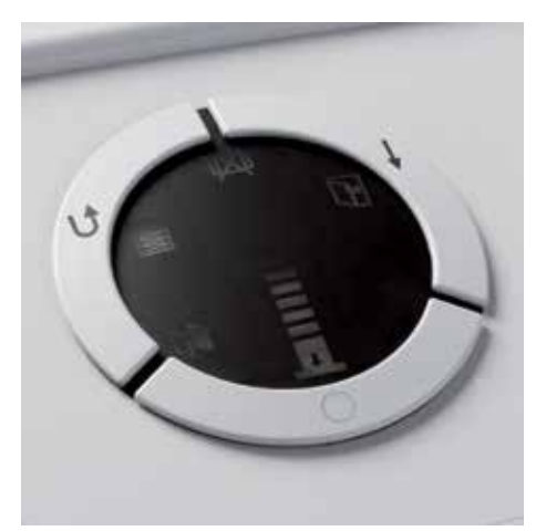
Clearly designed, user-friendly control panel permits easy, self-explanatory operation with illuminated symbols and acoustic signals