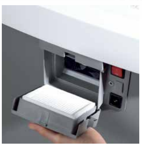
Environmentally-friendly filter is easy to change. A signal on the user-friendly control panel indicates when the fine dust filter needs changing