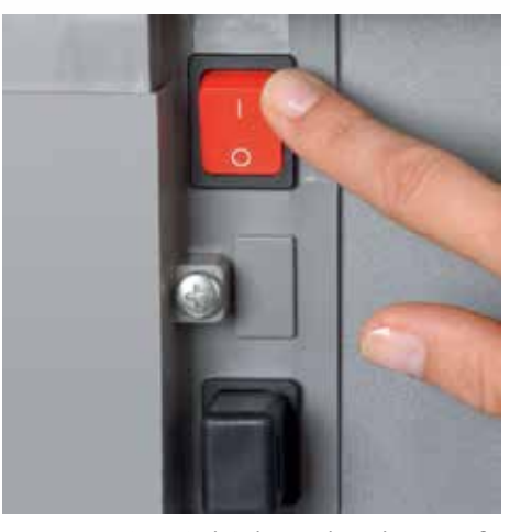
Separate main switch is located on the rear of the document shredder and completely disconnects it from the mains power supply