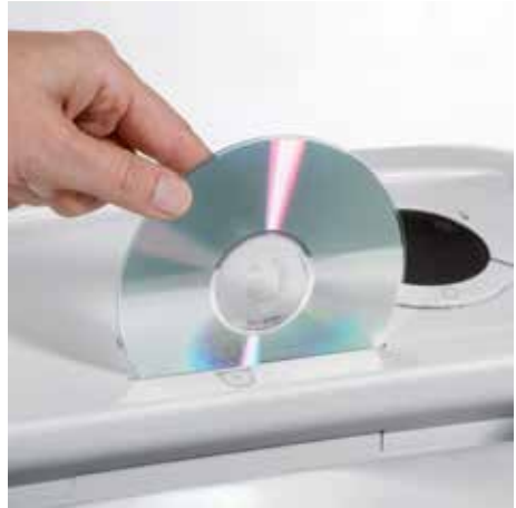
Separate feed opening for CDs, DVDs, cheque and credit cards guarantees reliable shredding of optical, magnetic and/or electronic data carriers