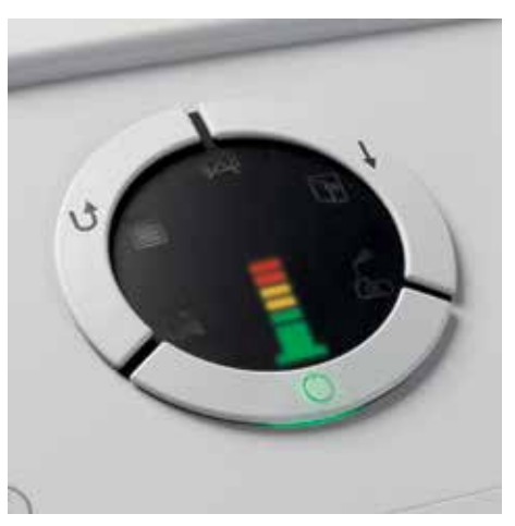
Paper quantity sensors prevent the document shredder from starting if too much has been fed in to avoid paper jams

Automatic acoustic shut-down system with integrated microphone immediately stops the document shredder in an emergency in response to a call for help or knocks to the casing,