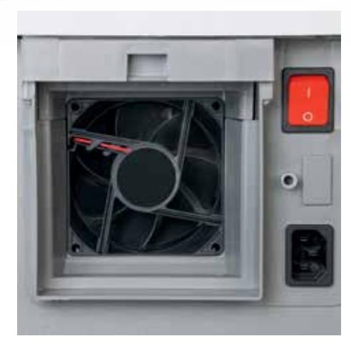
Powerful fan sucks in fine dust particles inside the document shredder and feeds them to the filter