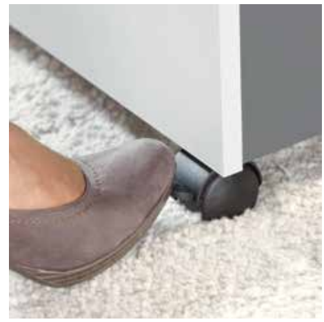
Convenient swivel casters providing 5 cm floor clearance for greater mobility and two brakes for reliably keeping the shredder firmly in place at the point of use