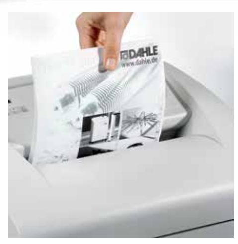
Standardised entry widths take all common paper sizes