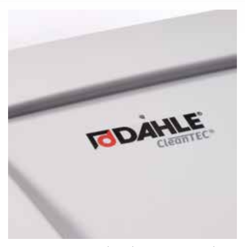
Automatic acoustic shut-down system with integrated microphone immediately stops the document shredder in an emergency in response to a call for help or knocks to the casing,