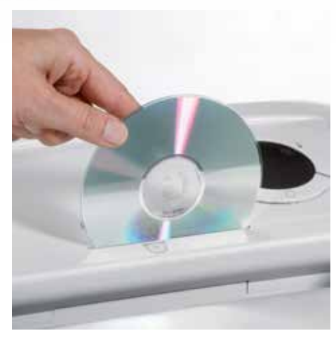
Separate feed opening for CDs, DVDs, cheque and credit cards guarantees reliable shredding of optical, magnetic and/or electronic data