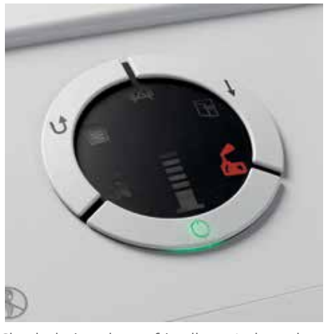
Clearly designed, user-friendly control panel signals oil refill