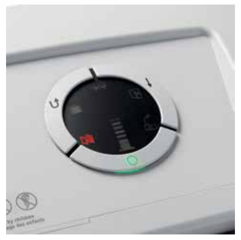
Clearly structured, user-friendly control panel indicates when the fine dust filter needs changing