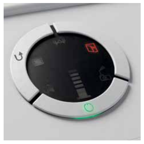
Visual and acoustic signal indicates open door