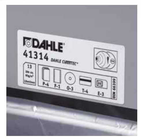
Clearly labelled performance characteristics on the top of the shredder help to ensure correct document shredder operation