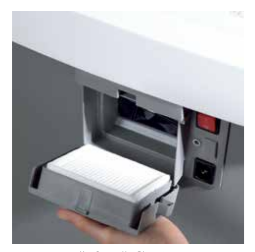
Environmentally-friendly filter is easy to change. A signal on the user-friendly control panel indicates when the fine dust filter needs changing