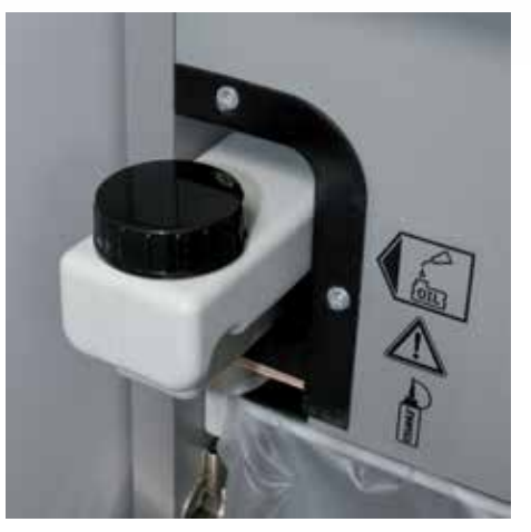
Integrated oil tank for controlled, automatic lubrication of the cross-cut cutters helps to lengthen service life while keeping performance constant