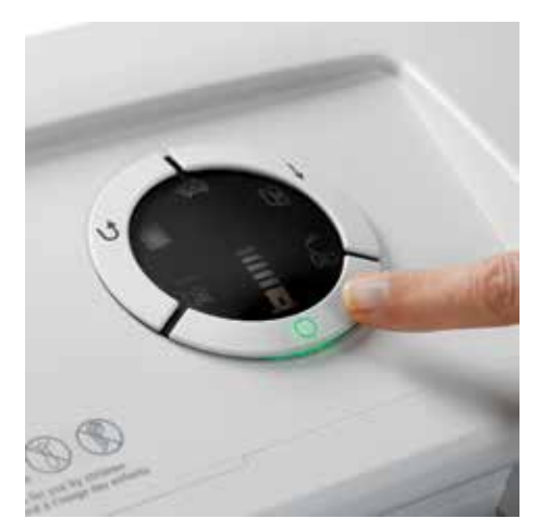
Clearly designed, user-friendly control panel permits easy, self-explanatory operation with illuminated symbols and acoustic signals