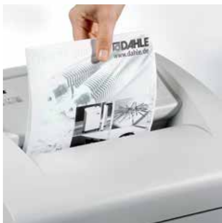
Standardised entry widths take all common paper sizes