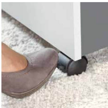
Convenient swivel casters providing 5 cm floor clearance for greater mobility and two brakes for reliably keeping the shredder firmly in place at the point of use