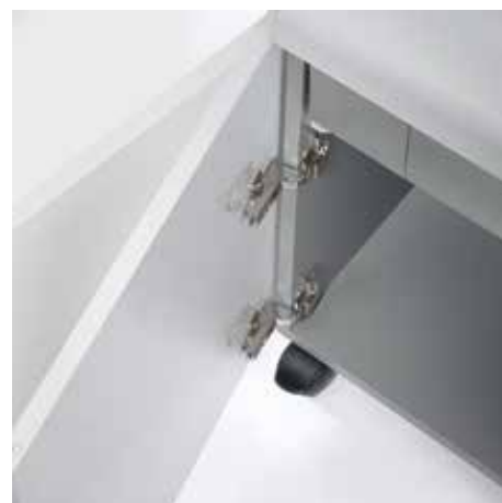
Wide opening door to easily empty the waste bag