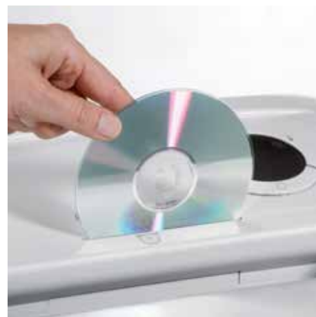
Separate feed opening for CDs, DVDs, cheque and credit cards guarantees reliable shredding of optical, magnetic and/or electronic data carriers