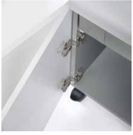
Wide opening door to easily empty the waste bag