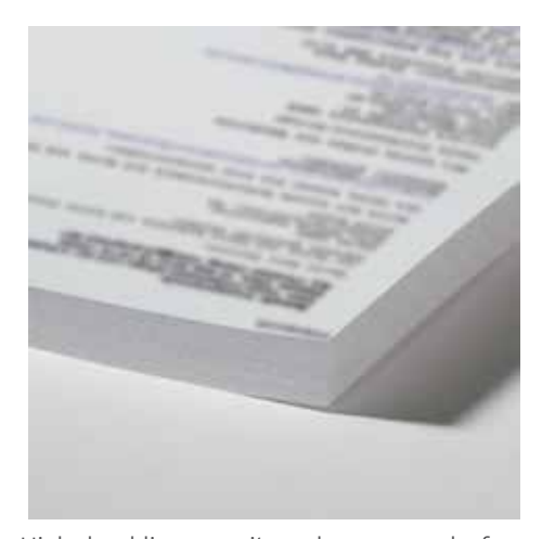
High shredding capacity makes easy work of shredding larger quantities of paper in one go