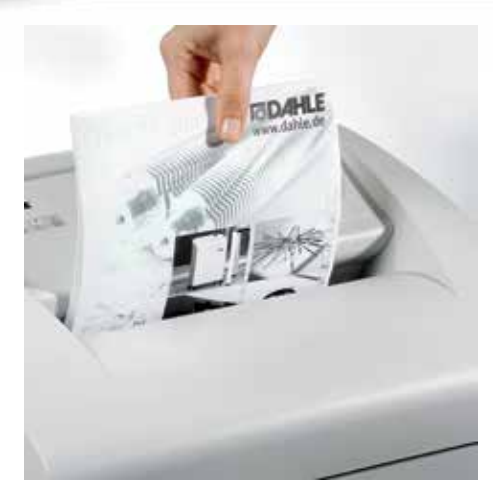
Standardised entry widths take all common paper sizes