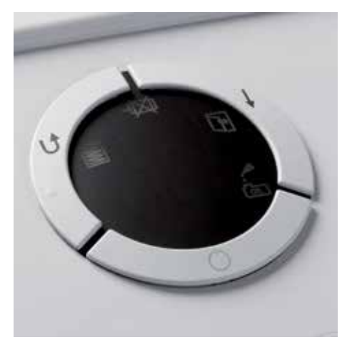
Clearly designed, user-friendly control panel permits easy, self-explanatory operation with illuminated symbols and acoustic signals