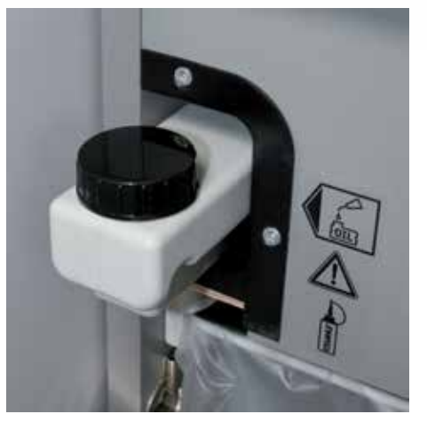
Integrated oil tank for controlled, automatic lubrication of the cross-cut cutters helps to lengthen service life while keeping performance constant