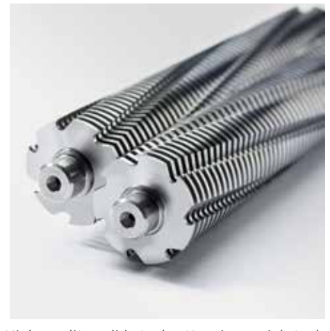
High-quality, solid-steel cutters in special steel for a guaranteed long service life