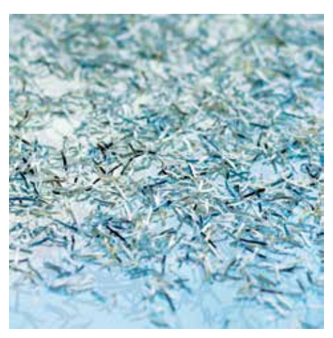
P-6 security: recommended for data media containing secret data demanding exceptionally stringent security measures