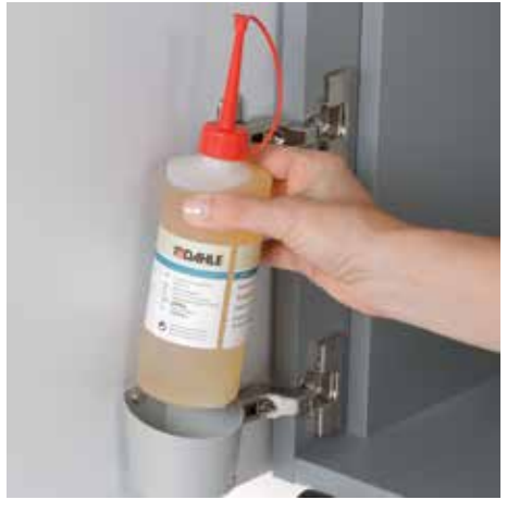
Environmentally friendly oil is always easy to access, included with all cross-cut models