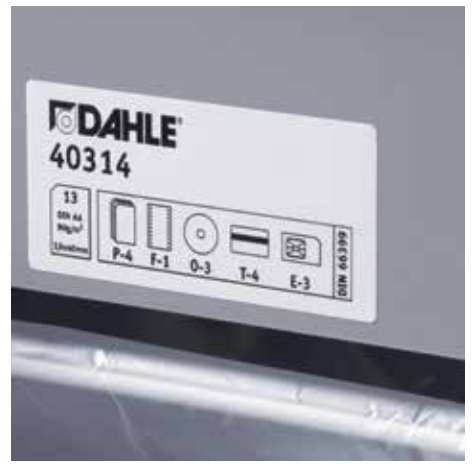
Clearly labelled performance characteristics on the top of the shredder help to ensure correct document shredder operation