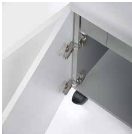
Wide opening door to easily empty the waste bag