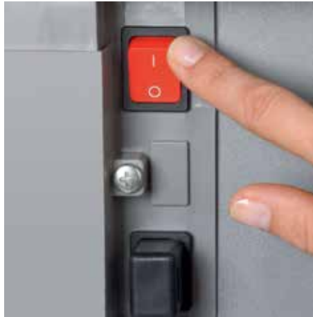
Separate main switch is located on the rear of the document shredder and completely disconnects it from the mains power supply