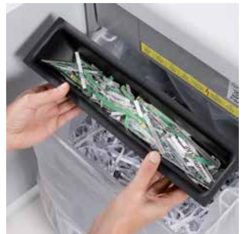
Separate, integrated waste boxes help to sort shredded paper, CDs, DVDs, cheque and credit cards for eco-friendly recycling