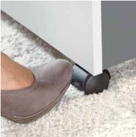
Convenient swivel casters providing 5 cm floor clearance for greater mobility and two brakes for reliably keeping the shredder firmly in place at the point of use