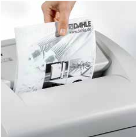
Standardised entry widths take all common paper sizes