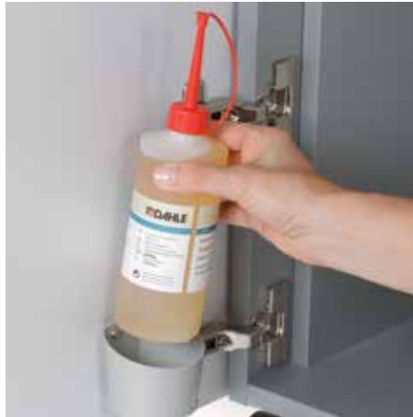
Environmentally friendly oil is always easy to access, included with all cross-cut models