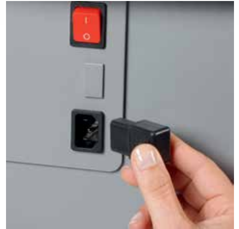
Detachable IEC power plug makes the document shredder quick and easy to move from A to B