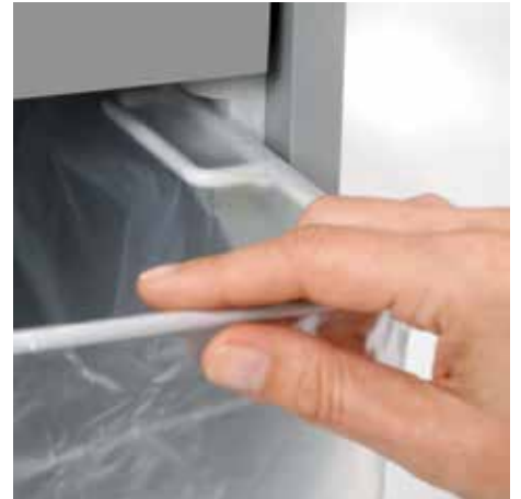
Pull-out rounded top frame that's kind on the fingers when changing the waste bag