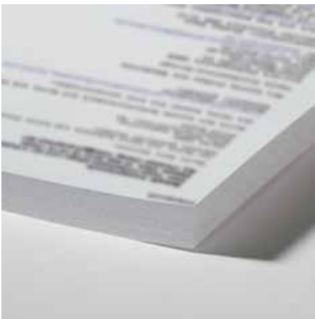
High shredding capacity makes easy work of shredding larger quantities of paper in one go