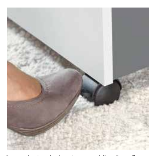
Convenient swivel casters providing 5 cm floor clearance for greater mobility and two brakes for reliably keeping the shredder firmly in place at the point of use