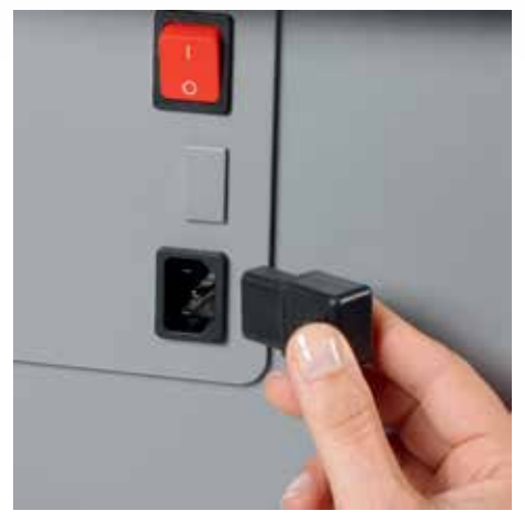
Detachable IEC power plug makes the document shredder quick and easy to move from A to B