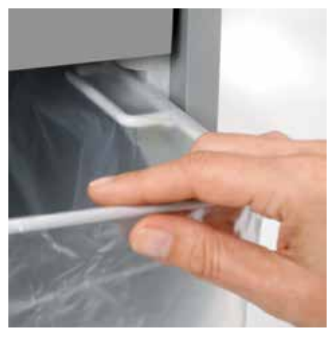
Pull-out rounded top frame that's kind on the fingers when changing the waste bag