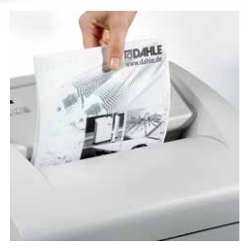
Standardised entry widths take all common paper sizes