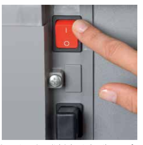
Separate main switch is located on the rear of the document shredder and completely disconnects it from the mains power supply