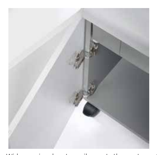
Wide opening door to easily empty the waste bag