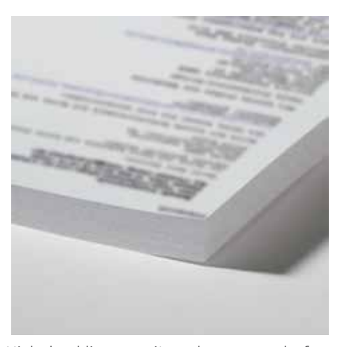
High shredding capacity makes easy work of shredding larger quantities of paper in one go