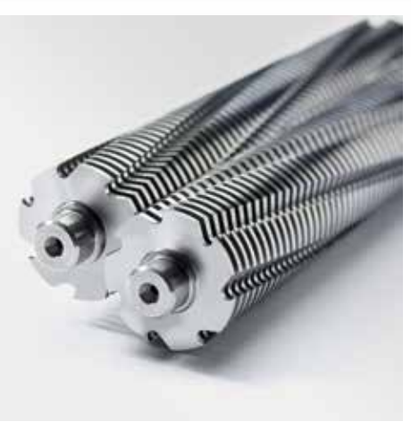
High-quality, solid-steel cutters in special steel for a guaranteed long service life