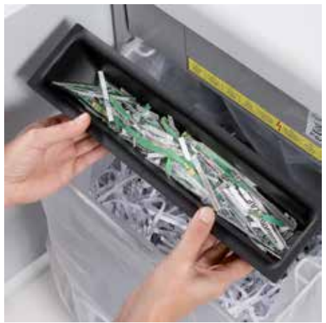
Separate, integrated waste boxes help to sort shredded paper, CDs, DVDs, cheque and credit cards for eco-friendly recycling