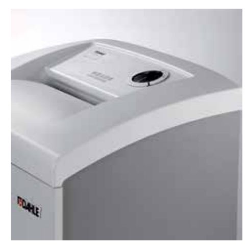
Modern design blends into any working environment.