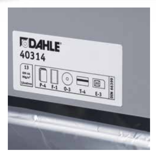
Clearly labelled performance characteristics on the top of the shredder help to ensure correct document shredder operation