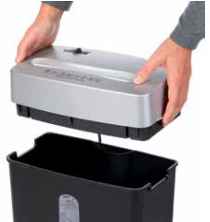
Removable top part for conveniently emptying the waste box