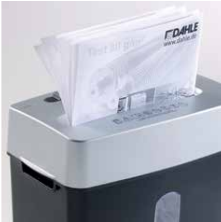
Paper easily feeds in sizes up to A5