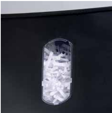
Practical viewing window instantly shows how full the waste box is