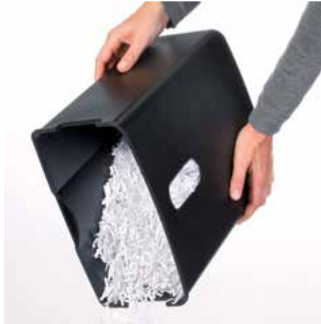
Easy emptying of the waste container