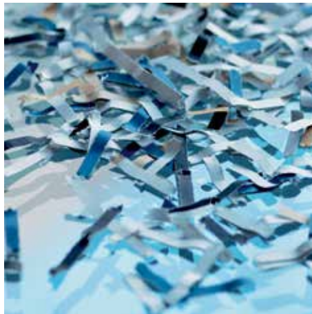
P-4 security: recommended, for example, for data media containing particularly sensitive, confidential and personal data