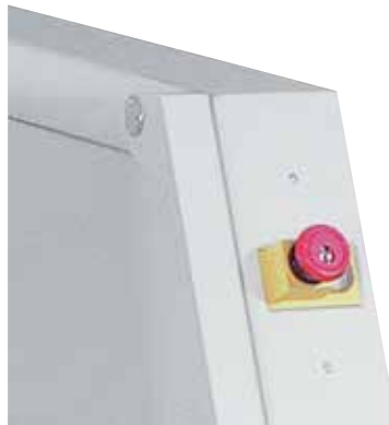
Prominent emergency-stop switch permits fast shredder shut-down