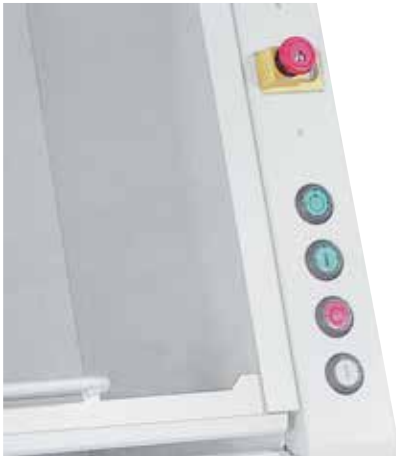
Clearly designed control panel permits convenient document shredder handling