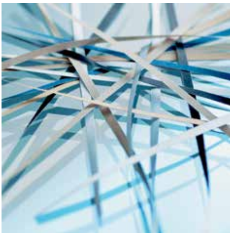
P-2 security: recommended, for example, for data media containing internal data that are to be made illegible