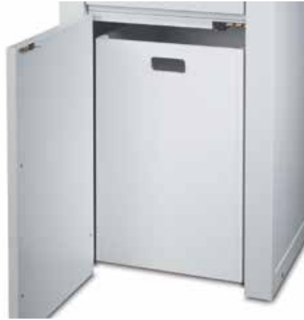
Mobile waste container for ease of emptying in models 20451, 20452 and 20454