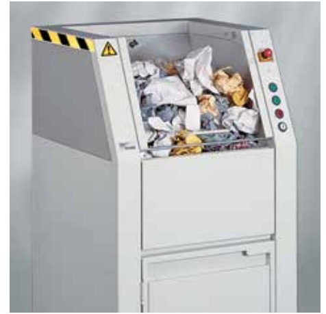
Wide feed hopper takes the contents of full wastepaper baskets, making shredding even easier