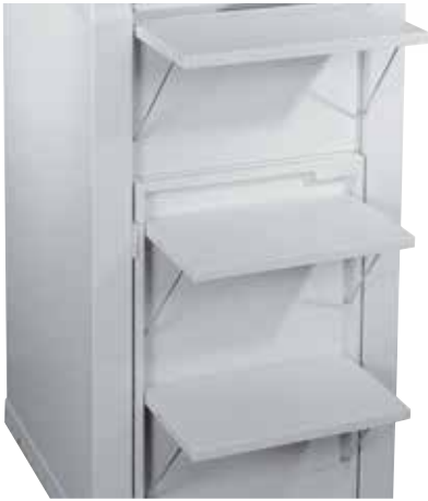
Practical storage shelves can be folded down to save space